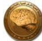
The Egyptian Society of Neurology, Psychiatry and Neurosurgery